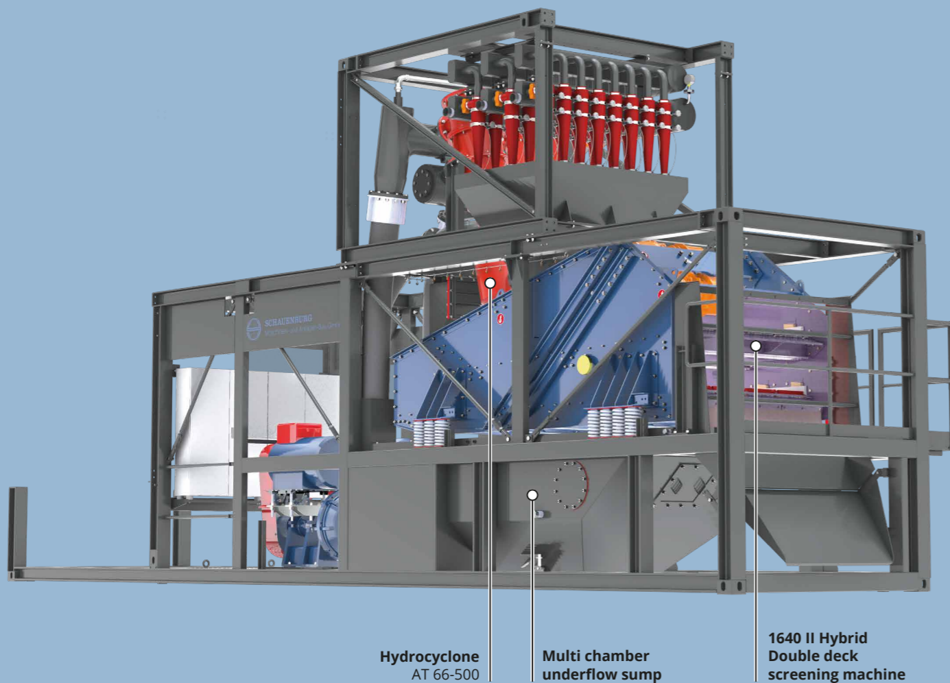
Hydrocyclone AT 66-500

This compact but high-performance separation system has been designed to recycle the slurry as completely as possible, so that it can be used in the slurry cycle for as long as possible, saving on disposal costs and costs for additives. Both cyclone stages are equipped with MAB cyclones, which guarantee excellent separation cut points. The plant design ensures that 100% of the slurry is recycled successively in both cyclone stages in each cycle.